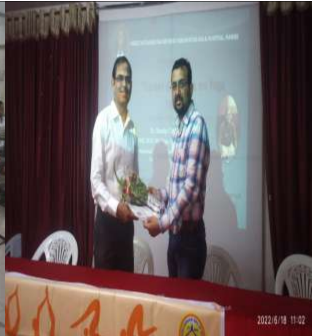
CME ON CAREER GUIDANCE IN YOGA THERAPY 18.06.2022

Nashik, Maharashtra, India 2R98+78X, Hirawadi, Nashik, Maharashtra 422207, India Lat 20.018333° Long 73.815866° 18/06/22 10:45 AM