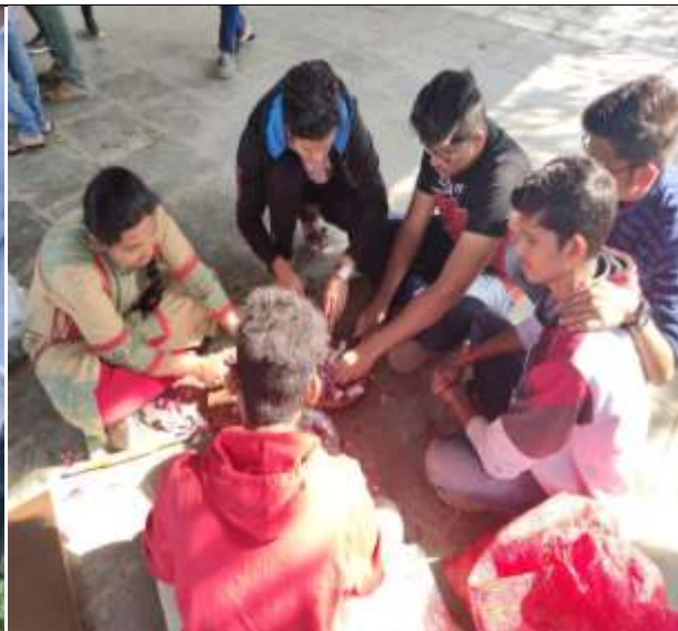
CLEANLINESS, HYGEINE AWARENESS