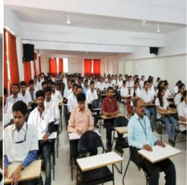
CME ON YOGA AND MEDITATION 05.06.2018