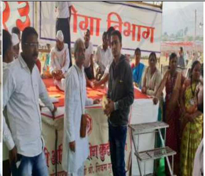
SWASTHYA RAKSHAN PROGRAMME FOR GIRNARE VILLAGE 2018-YOGA AND MEDITATION SESSION