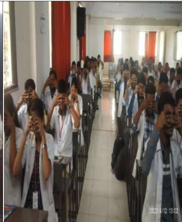
CME STRESS MANAGEMENT THROUGH BHRAMARY PRANAYAM 12.04.2022

Nashik, Maharashtra, India 2R98+78X, Hirawadi, Nashik, Maharashtra 422207, India Lat 20.018294° Long 73.815892° 12/04/22 12:28 PM