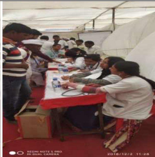
HEALTH CHECK UP CAMP ODHA VILLAGE NASHIK 2019