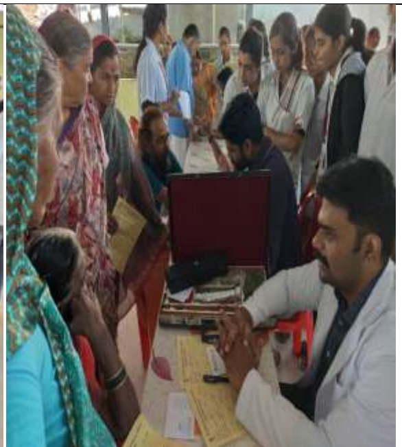
SWASTHYA RAKSHAN PROGRAMME FOR GIRNARE VILLAGE 2018-SCHOOL CHECK UP