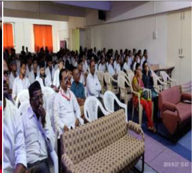
CME ON NATIONAL VECTOR BORNE DISEASE CONTROL PROGRAMME 27.10.2019